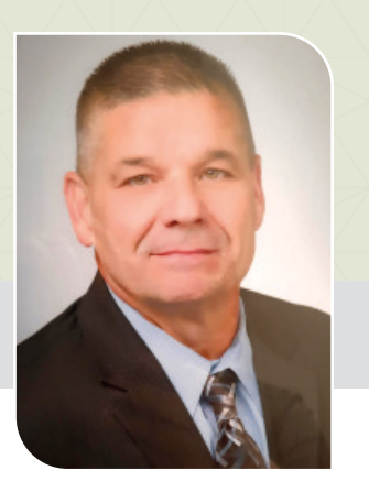
Letter from the Chair

Coyote Crisis Collaborative is a multi-disciplinary preparedness network supporting robust healthcare and other community sector emergency management programs. A spectrum of leaders from diverse areas of emergency preparedness and response collaborate, learn from, and challenge one another in developing preparedness capabilities linked to assessment, planning, communications/situational awareness, training, and exercises. The mission of the Coyote Crisis Collaborative is to provide tools, training, resources, and information to facilitate continuous improvement in community disaster preparedness, mitigation, response, and recovery.